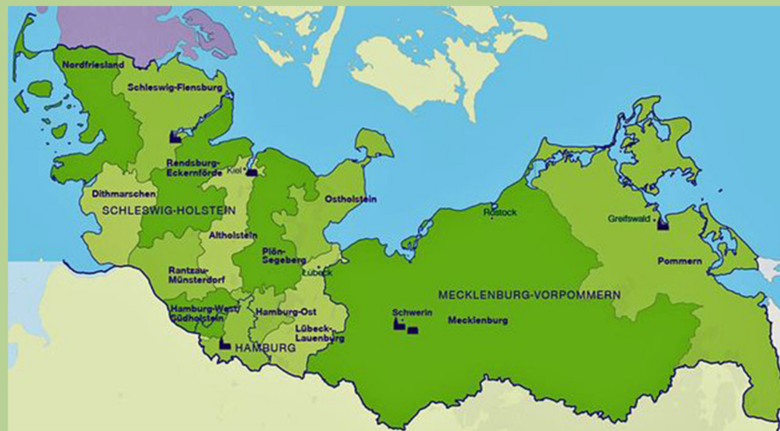
Area of the Evangelical Lutheran Church in Northern Germany (Nordkirche)

Members in this Platform will work as equals and Partners. The communication platform is aimed at helping both Church communities for a better understanding of their co-existence as Christians, common goals in the field of mission, exchange of help where and when necessary and also networking within the Churches.